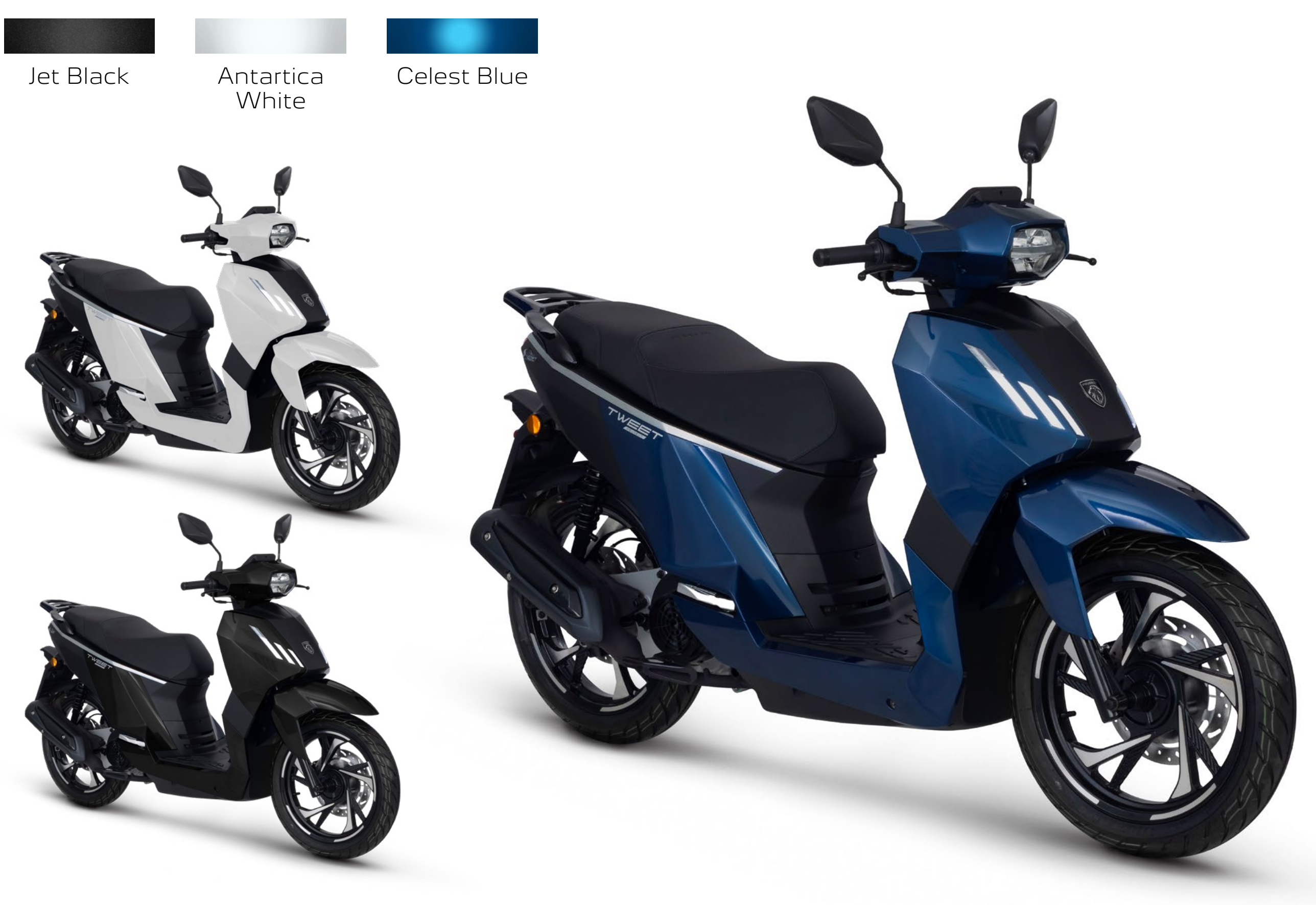
*On 125cc version - Photos not contractually binding

Diamond-cut rims* • LED lighting • Dashboard with LCD screen • Telescopic front fork • Two-seater saddle Dual rear shock absorbers • USB power socket • Underseat storage for open-face helmet with visor Foldaway passenger footrests